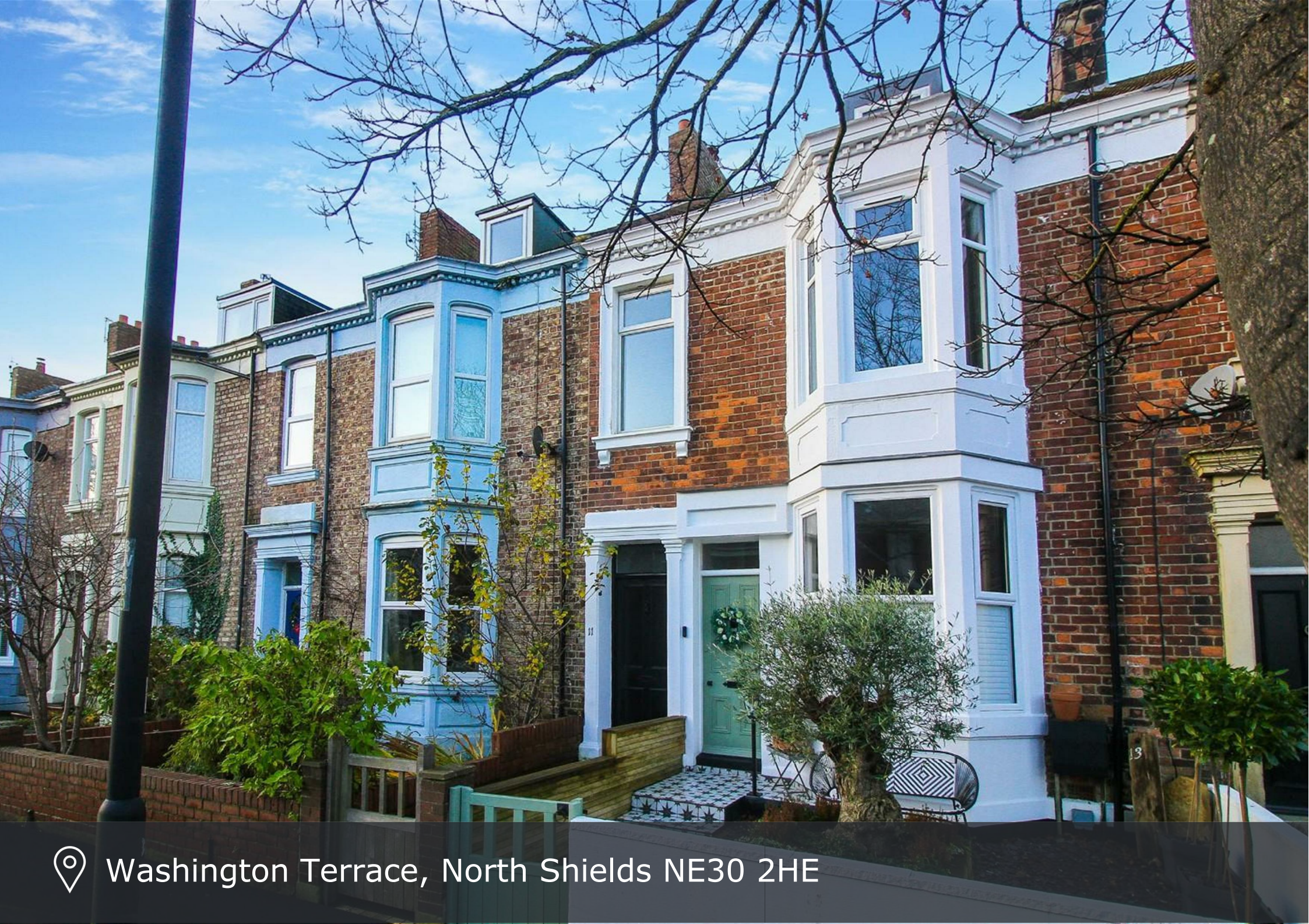
📍 Washington Terrace, North Shields NE30 2HE